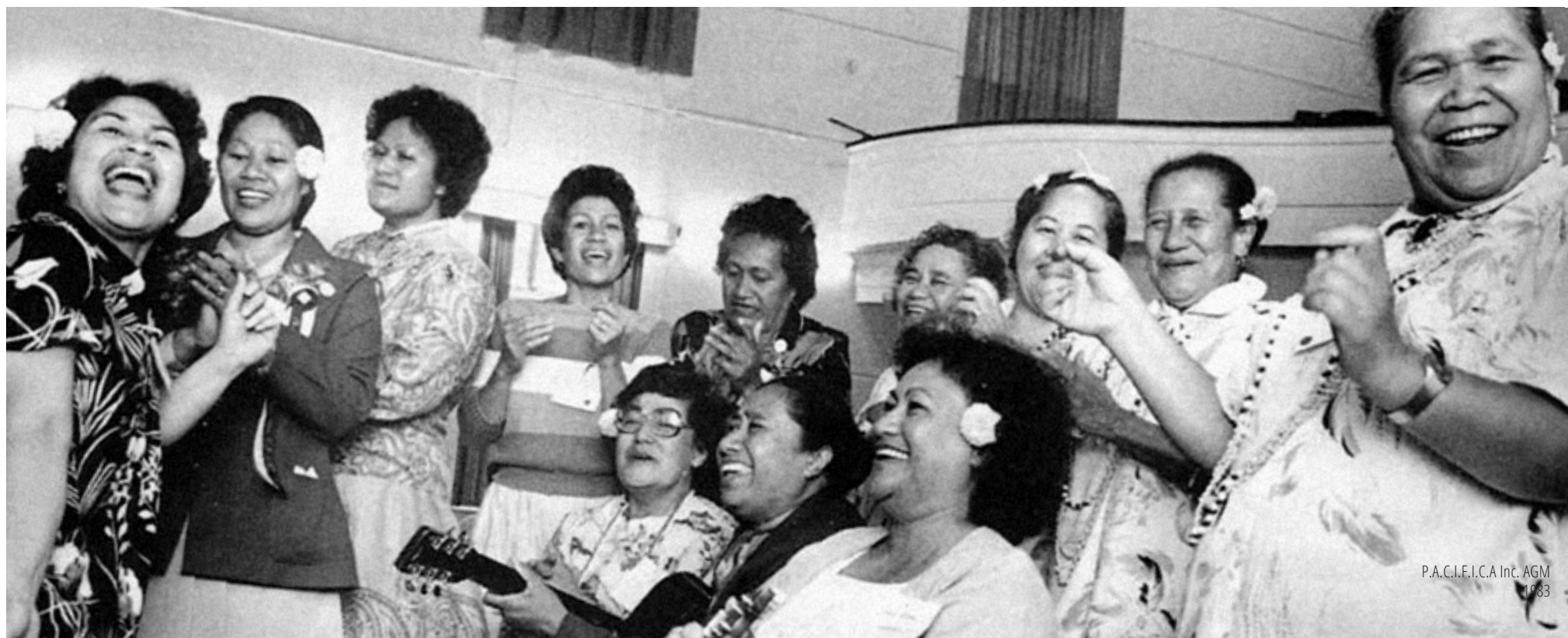
P.A.C.I.F.I.C.A. Inc. AGM 1983

on its performance in relation to the UN Convention on the Elimination of all Forms of Discrimination against Women (CEDAW), and she also heard the reports from other Pacific countries. In 2018 Tagaloatele Professor Peggy Fairbairn-Dunlop represented P.A.C.I.F.I.C.A. Inc. in a panel debate on CEDAW at the Auckland Council. In 2019, National Executive submitted an application for consultative status to the United Nations Economic and Social Council (outcome currently pending). P.A.C.I.F.I.C.A. Inc. are also collaborating with the Human Rights Commission in supporting and endorsing the National Pay Transparency campaign.